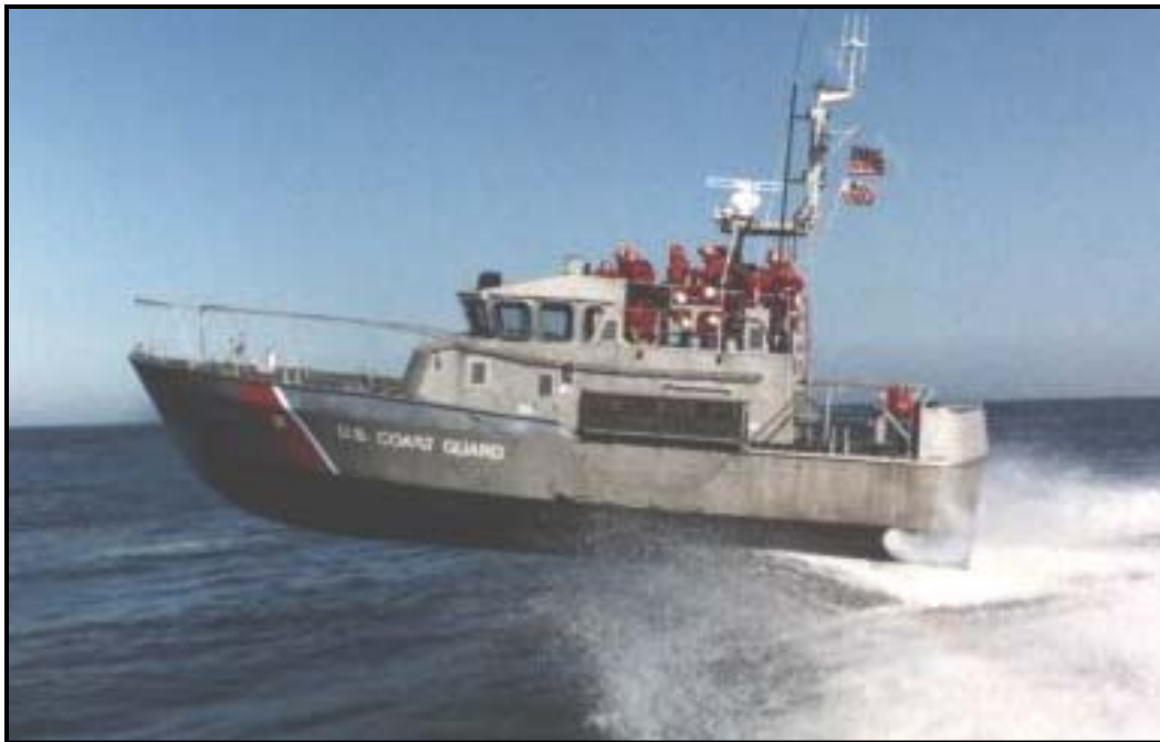
United States Coast Guard 47' Motor Life Boat 5000 Series Marine Grade Alloy at Sea