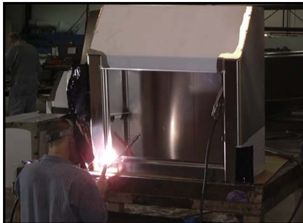
Welding a console