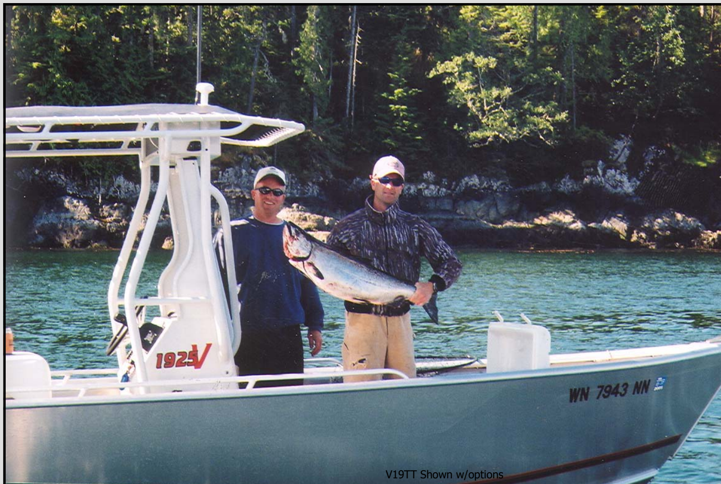
V19TT Shown w/options