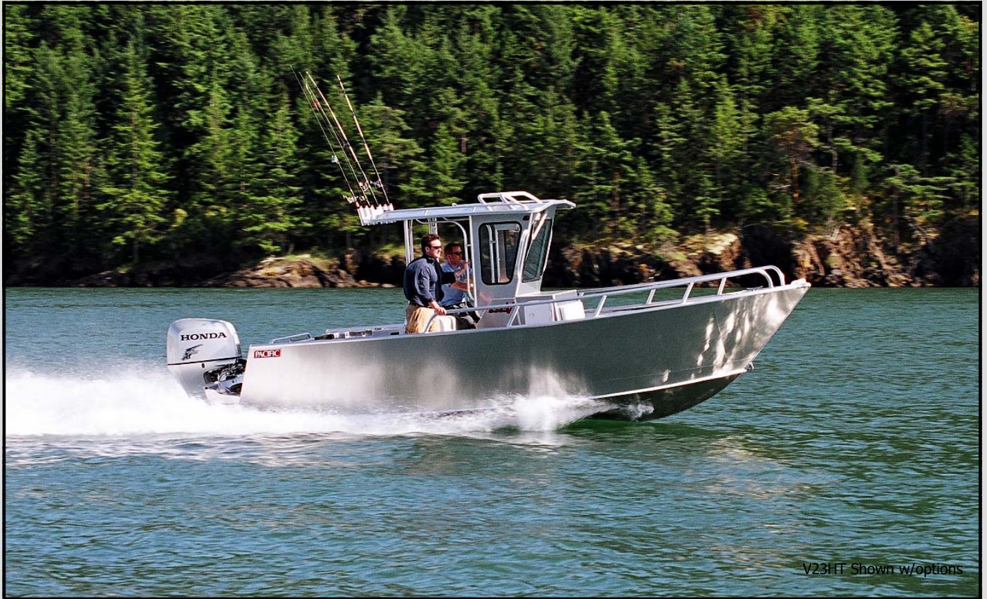
V23HT Shown w/options